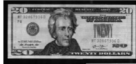
Retrieved from LTA-350