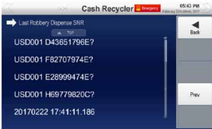
Display Screen showing robbery dispense