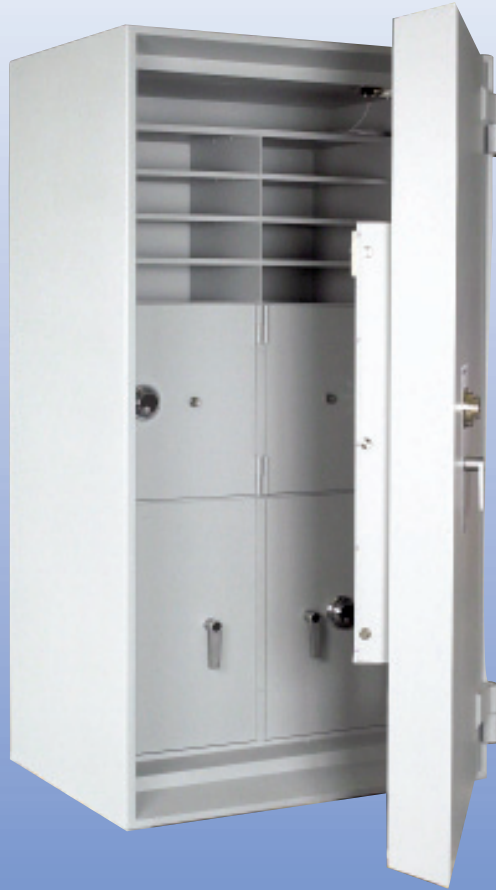
Large 36" W x 72" H x 30" D TR/TL 30 with interior layout for teller trays and cash storage.