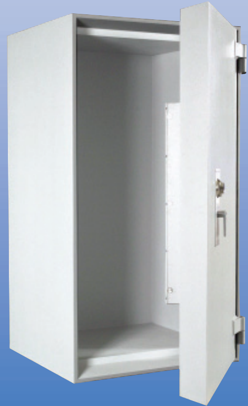
Chest interiors may be arranged in any modular or custom configuration.